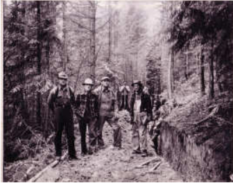
Crew engineering the Troy Reservoir