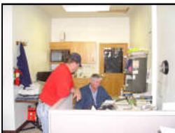
MAYOR AT WORK